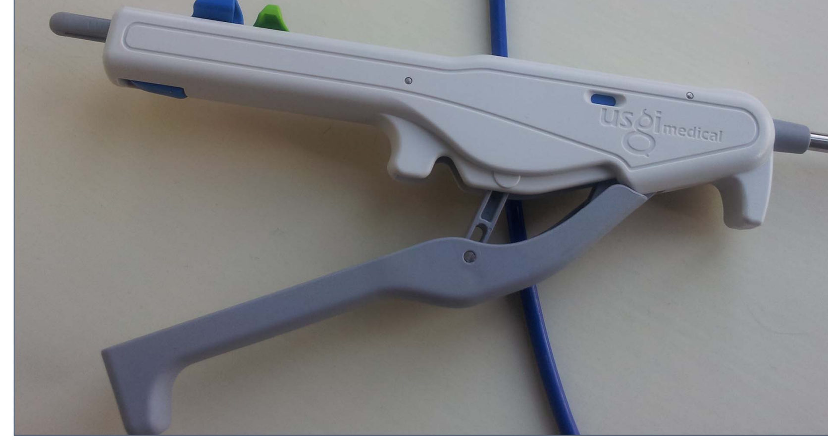
Fig 2: g-Prox<sup>®</sup> Tissue Grasper/Approximation Device

POSE can be safely performed and 42% EBWL achieved in short follow up is encouraging. Long term follow up results will define the role of POSE in management of obesity.